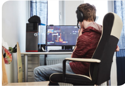
personal computer (PC) game