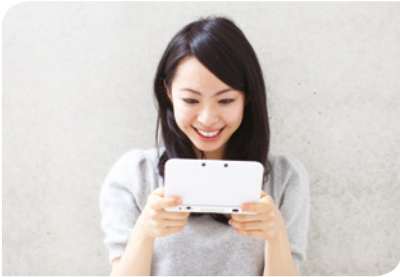
handheld games console