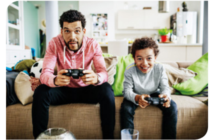
home video games console

B 6.02 LISTENING SKILL—Listen to understand different native speakers You are going to hear four different native speakers talking about computer games. How easy do you think the native speakers are to understand?